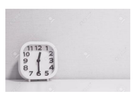
B) It is half past _____.