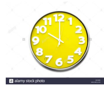
D) It is _____