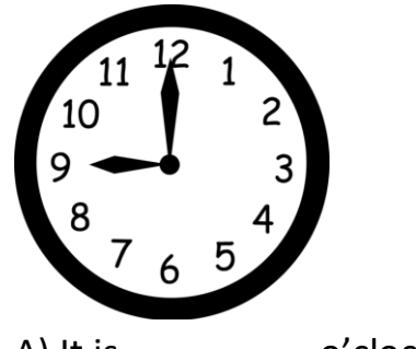
A) It is _____ o'clock