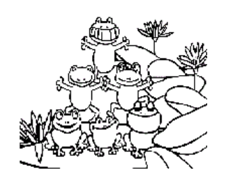
That is a green_____